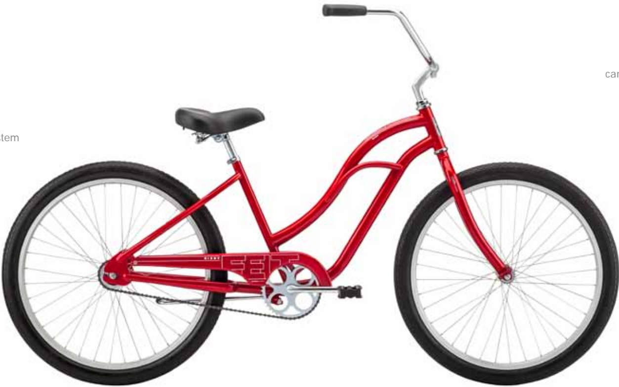
candy apple red

Cantilever steel frame 1sp w/ coaster brake Aluminum adjustable height quill stem w/ Hi-rise cruiser bar Extra-wide 32mm aluminum rims w/ stainless steel spokes 26 x 2.125 balloon cruiser tires