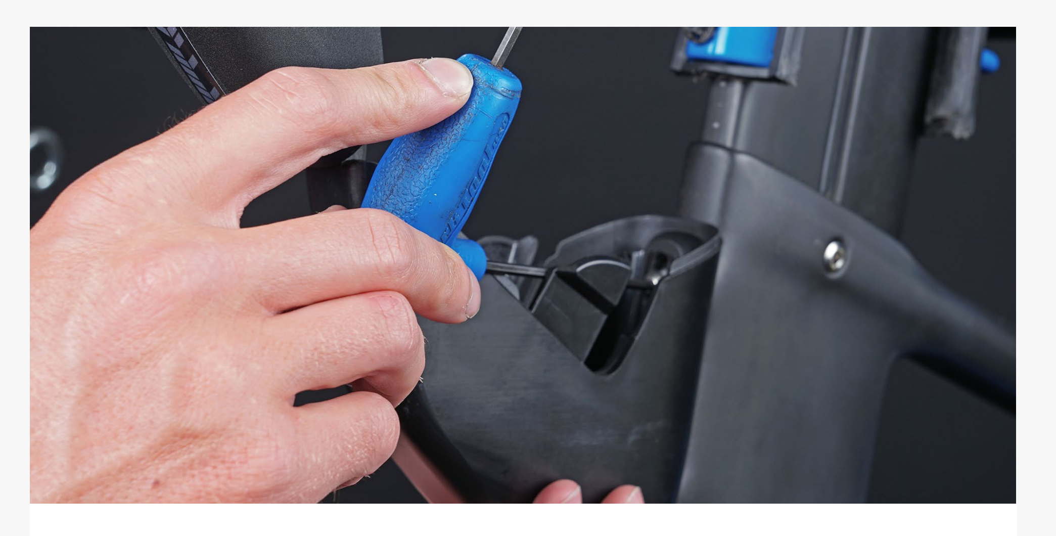
Step 3: Slide the box up over the top screw post. Insert the top screw and tighten to 4Nm.