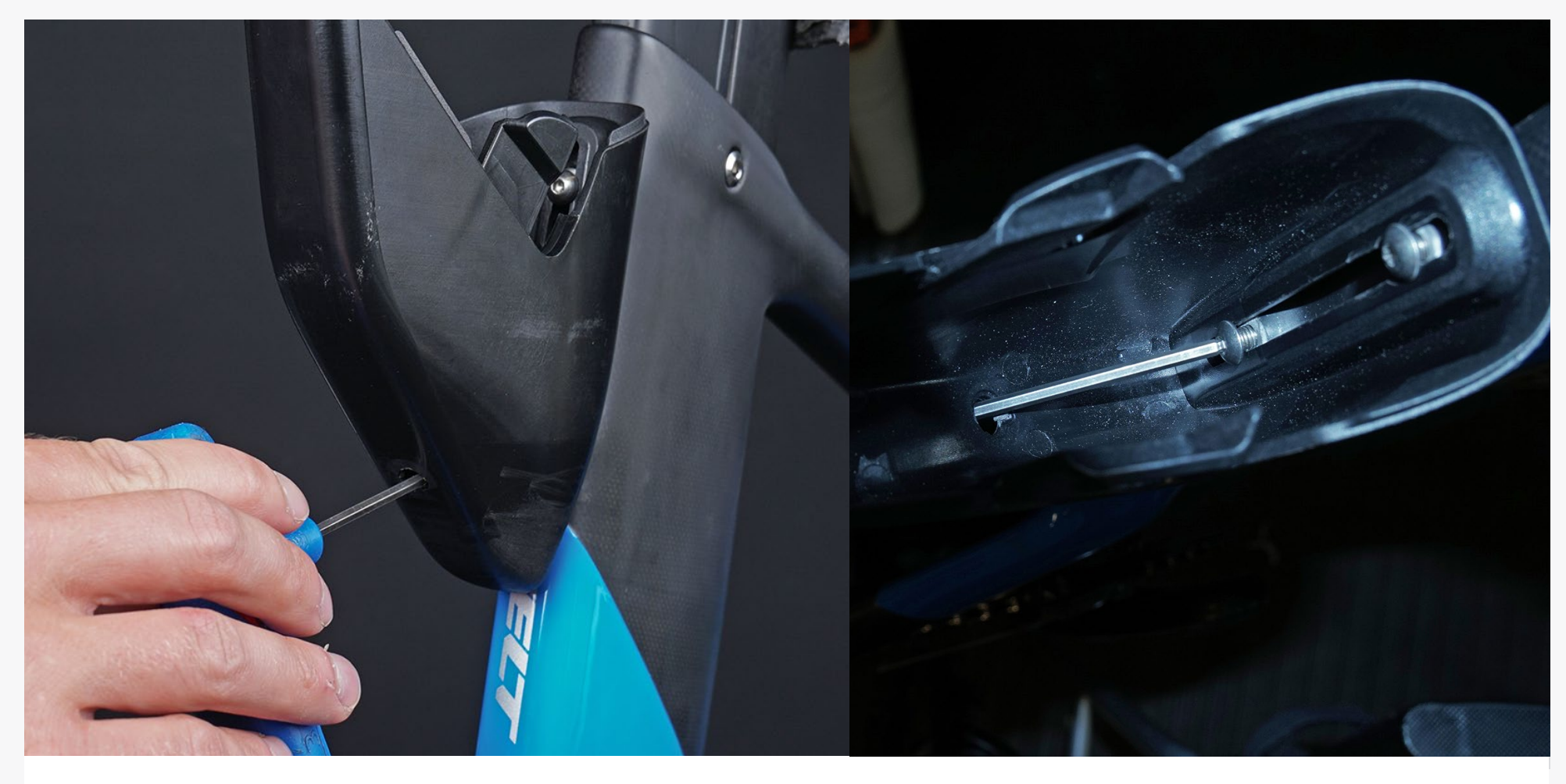
Tighten to 4Nm.