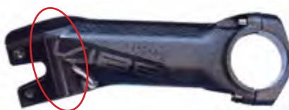
Figure 1: Cracking can occur in the clamping area of the fork steerer tube.

Corrosion can lead to cracks forming in the clamping area of the fork steerer tube (as highlighted in Figure 1).